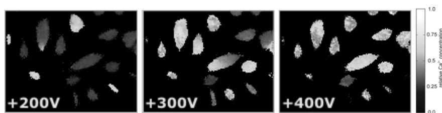
Figure 2: Cells stained with Fura-2AM and exposed to electric pulse with increasing amplitude.

Using a Cliniporator TM device, deliver one electric pulse of 100 \mu\text{s} with voltages varying from 150 to 300 V. Immediately after the pulse, acquire two fluorescence images of cells at 540 nm, one after excitation with 340 nm and the other after excitation with 380 nm. Divide these two images in MetaFluor to obtain the ratio image ( R = F_{340}/F_{380} ). Wait for 5 minutes and apply pulse with a higher amplitude. After each pulse, determine which cells are being electroporated (Figure 2). Observe, which cells become electroporated at lower and which at higher pulse amplitudes.